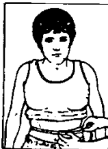
Figure A7.2. Waist Measurement.

A7.2.2. With the individual standing with arms at her sides and at the end of a normal relaxed exhalation, measure the natural waist circumference. The natural waist circumference is the narrowest point, usually located about half-way between the navel and the lower end of the sternum (breast bone). When it is not easy to distinguish the narrowest point, take several measurements and use the smallest (Figure A7.2). Waist measurements will be rounded down to the half-inch (i.e., round 25 3/4 inches to 25 1/2 or 25 1/4 to 25 inches).