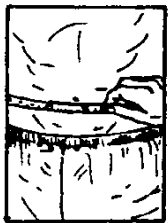
Figure A6.2. Abdominal Measurement.

A6.2.3. The individual's body fat percentage is determined by first subtracting the neck measurement from the abdominal measurement (ensure the rounded measurements are used,