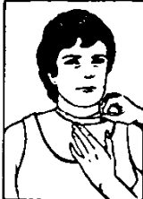
Figure A7.1. Neck Measurement.

A7.2.2. With the individual standing with arms at her sides and at the end of a normal relaxed exhalation, measure the natural waist circumference. The natural waist circumference is the narrowest point, usually located about half-way between the navel and the lower end of the sternum (breast bone). When it is not easy to distinguish the narrowest point, take several measurements and use the smallest (Figure A7.2). Waist measurements will be rounded down to the half-inch (i.e., round 25 3/4 inches to 25 1/2 or 25 1/4 to 25 inches).