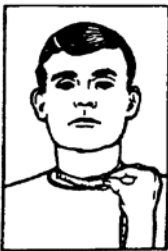
Figure A6.1. Neck Measurement.

A6.2.2. With the individual standing with arms at his sides and at the end of a normal relaxed exhalation, measure the abdominal circumference at the navel (belly button) while keeping the tape level to the floor. Abdominal measurements will be rounded down to the half-inch (i.e., round 34 3/4 inches to 34 1/2 or 34 1/4 to 34 inches) (Figure A6.2).